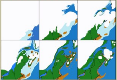
During the 'Younger Dryas' glaciers got bigger

20,000 to 10,500 years ago glaciers melted from the Maritimes