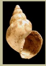
snail NBMG 4208

The end of the ice age was a time of rapid climate change especially during the 'Younger Dryas' cold interval. About 11,000 years ago temperatures plummeted about 7°C in a decade. Sub-arctic insects re-invaded the Maritimes for hundreds of years until temperature warmed again. A peat bog on the hill at Saints Rest Beach records this rapid climate event.