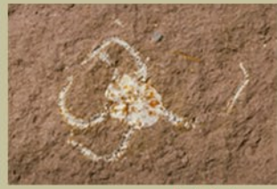
brittlestar NBMG 8440

FOSSILS ARE PROTECTED BY LAW IN NEW BRUNSWICK A PERMIT IS REQUIRED TO COLLECT FOSSILS If you find a fossil, note its location, photograph it and send the information to the New Brunswick Museum ( www.nbm-mnb.ca ).